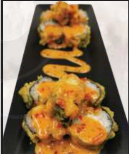
GOLDEN TUNA ROLL