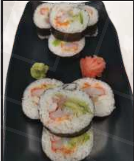
HOUSE SPECIAL MAKI

Beef Teriyaki, White Onion, Green Pepper & Cream Cheese