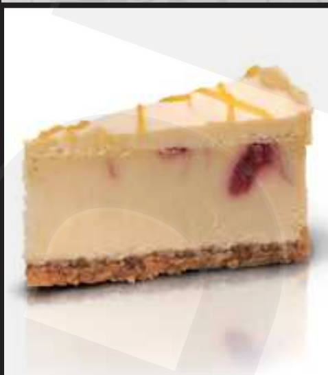
MANGO BERRY CHEESECAKE