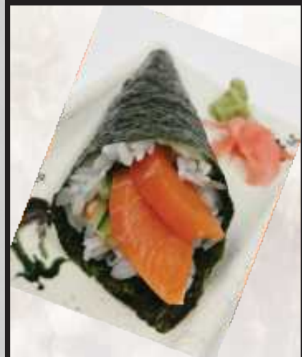
SPICY SALMON CONE