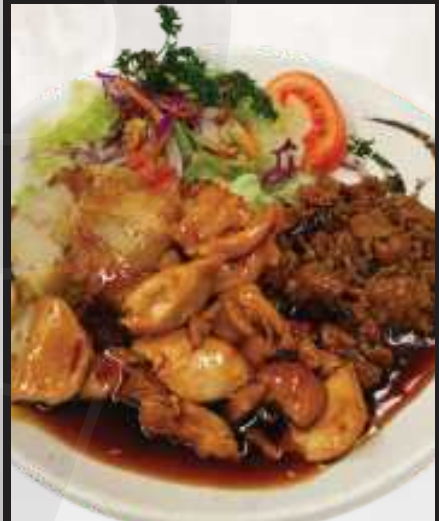
BEEF & CHICKEN TERIYAKI