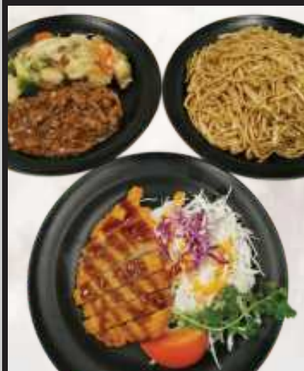
DINNER FOR TWO