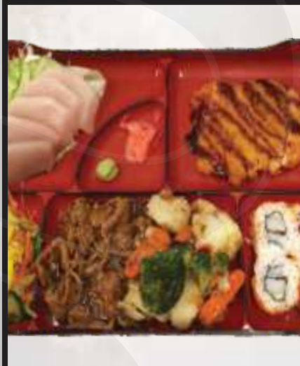
TUNA SASHIMI DINNER