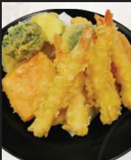
PRAWN & VEGETABLES TEMPURA